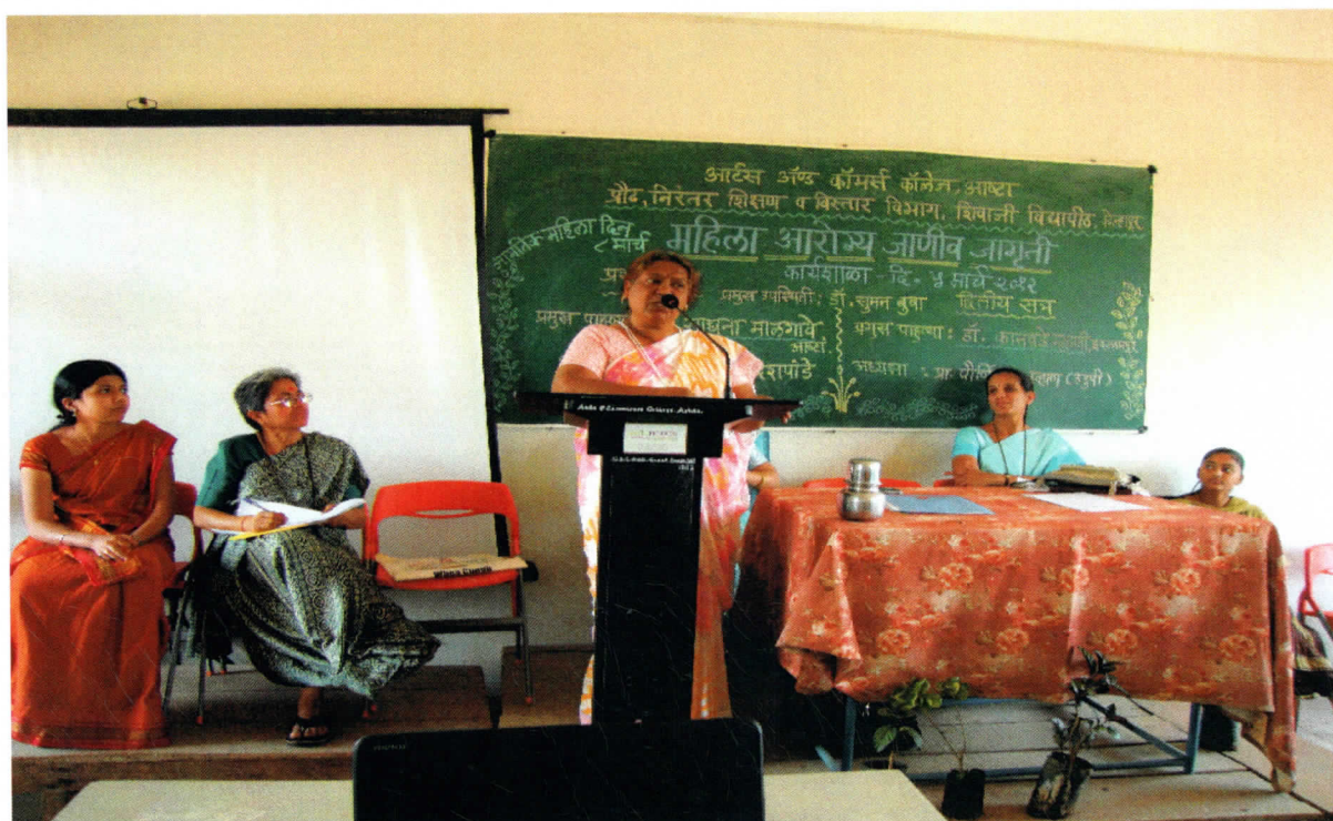
Celebration of World Womens Day.