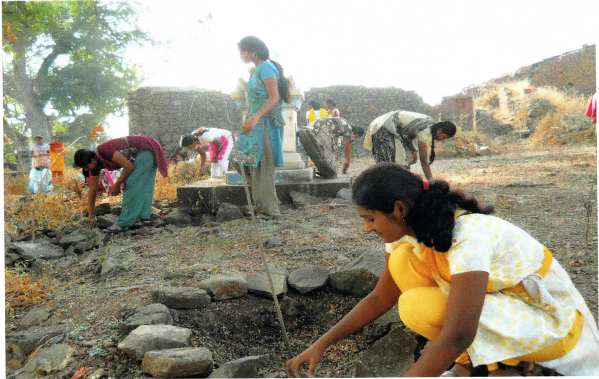
NSS Volunteers uprooting weeds and Plantation of Trees.