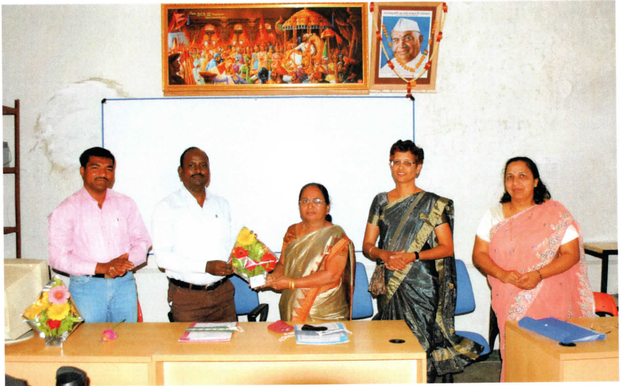
Inauguration of English Literature Association.