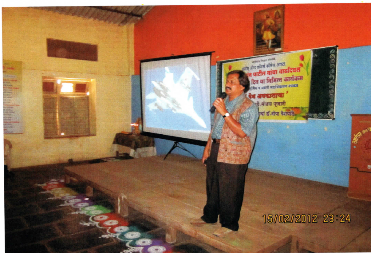
Celebration of Geography Day.