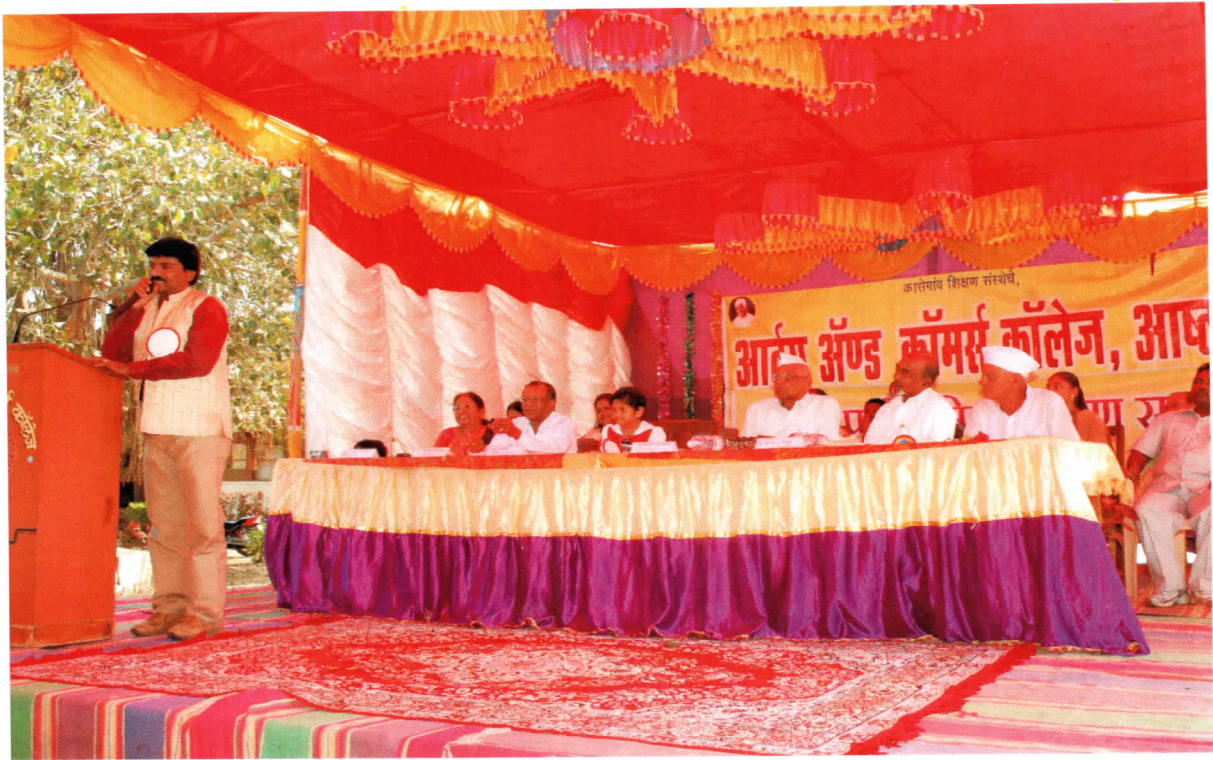
Speech of Chief Guest in Annual Social Gathering.