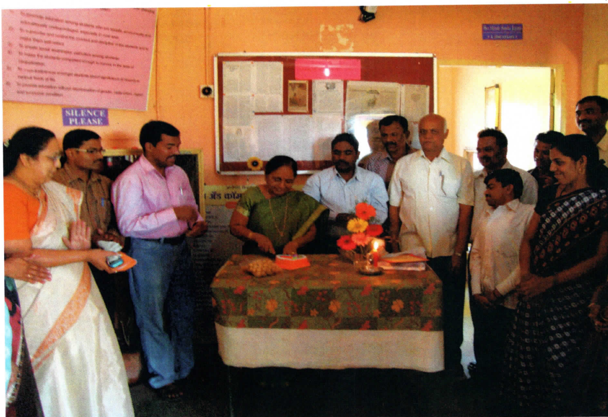
The Best Practices “Birth-day Celebration”