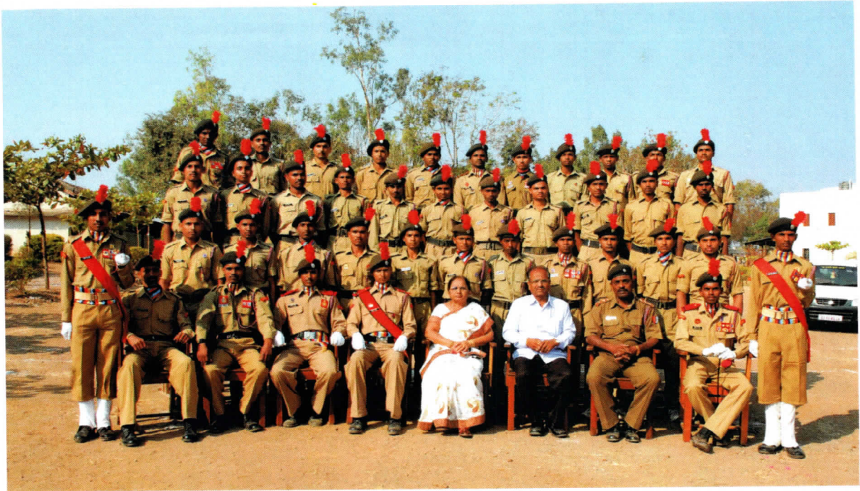
NCC Cadets with Principal.