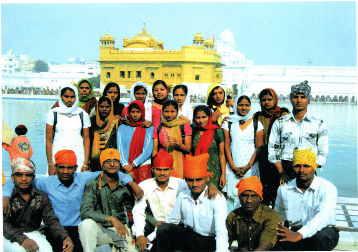
Geography Dept. Trip.