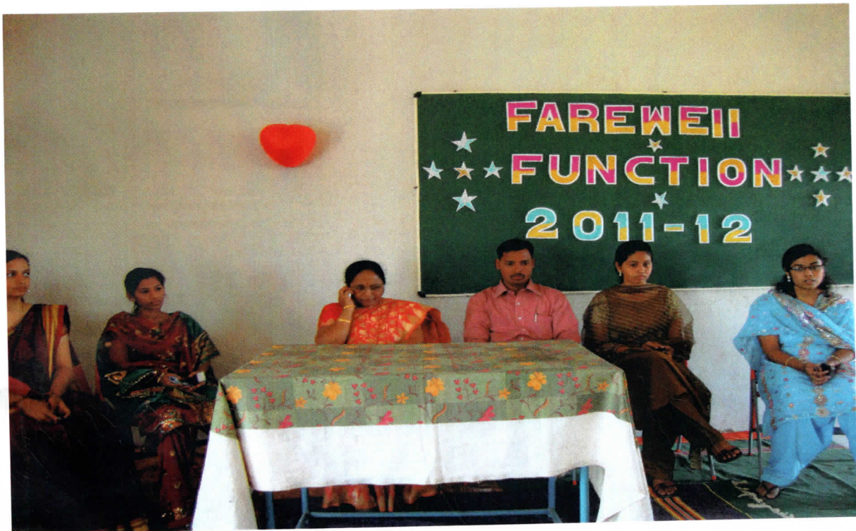
Farewell Function of B.C.A. Dept.