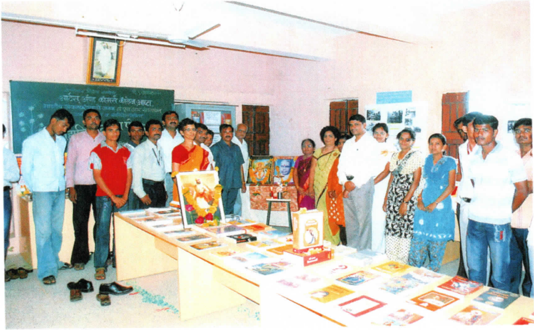
Book Exhibition organized Library