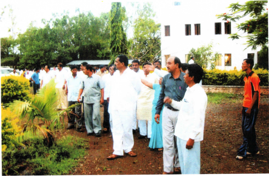
Visit of Hon. Rural Development Minister Shri. Jayant Patil.