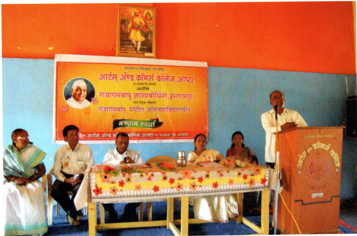
Inauguration of inter college Elocution competition.