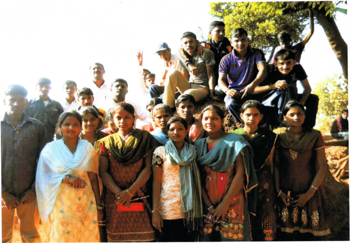
History Dept. Trip.