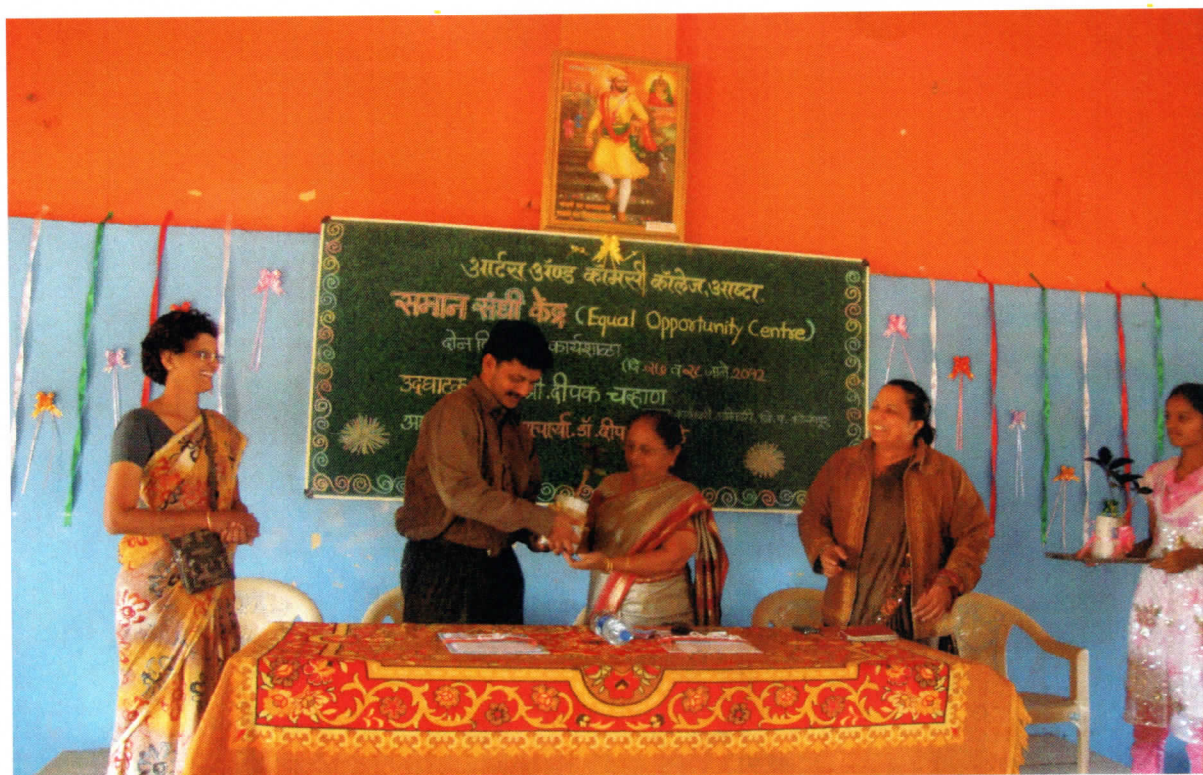
Workshop on Equal Opportunity