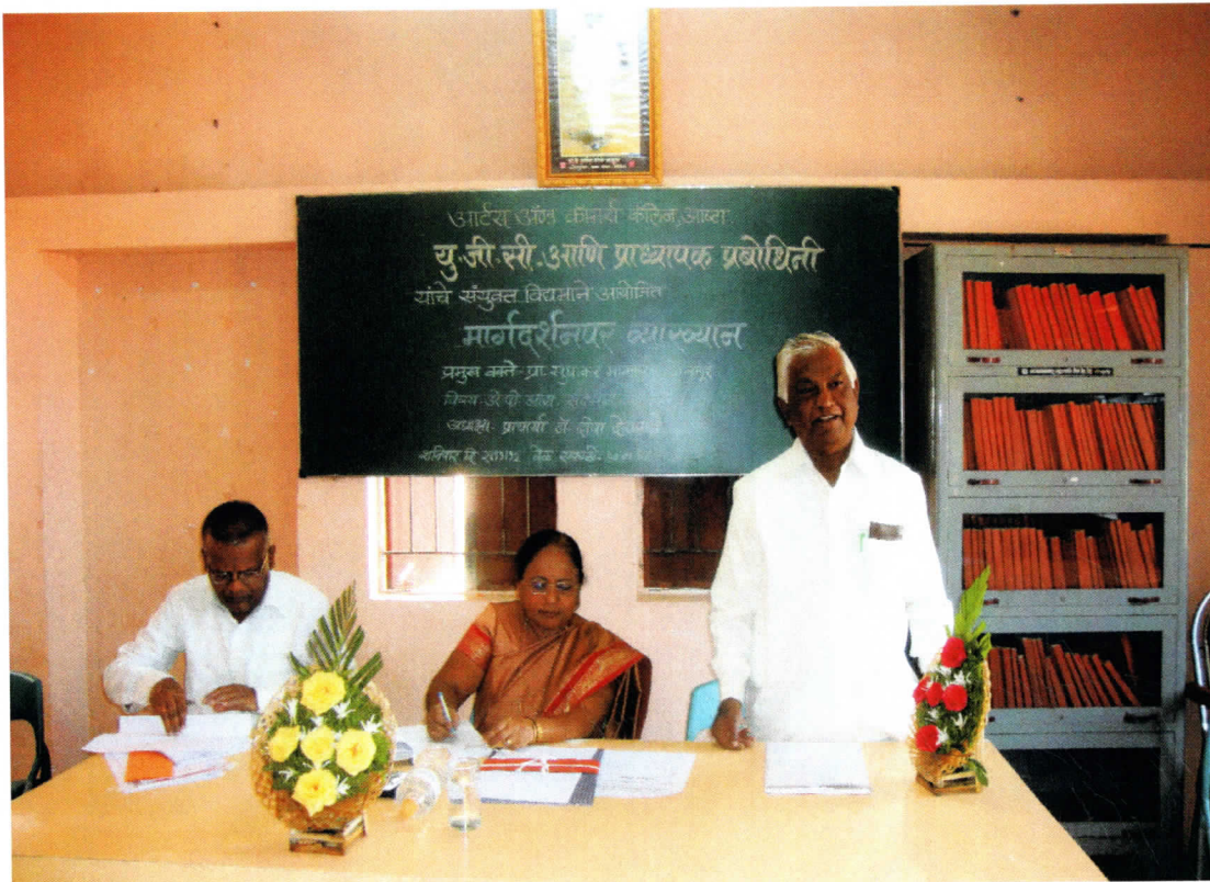
Activity of staff academy