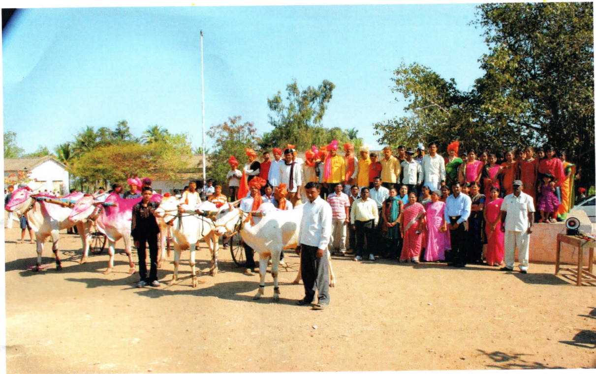
Celebration of Traditional Day.