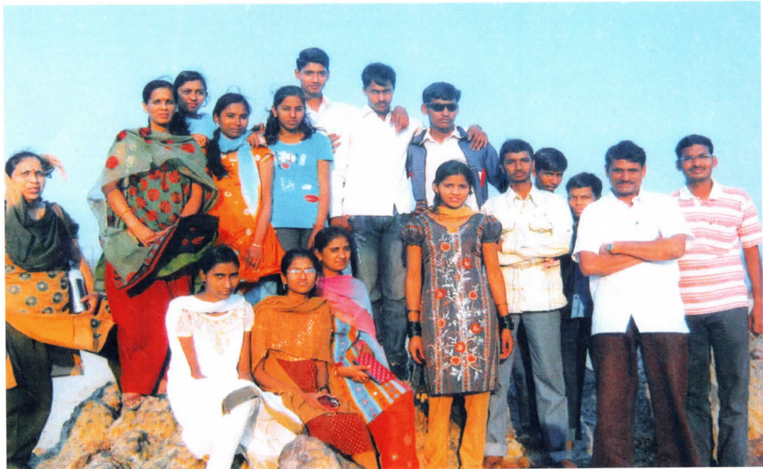
Commerce, English And Marathi Dept. Trip.