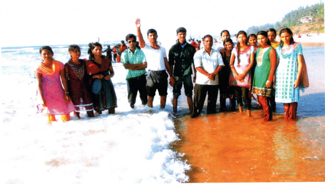
Hindi Dept. Trip.