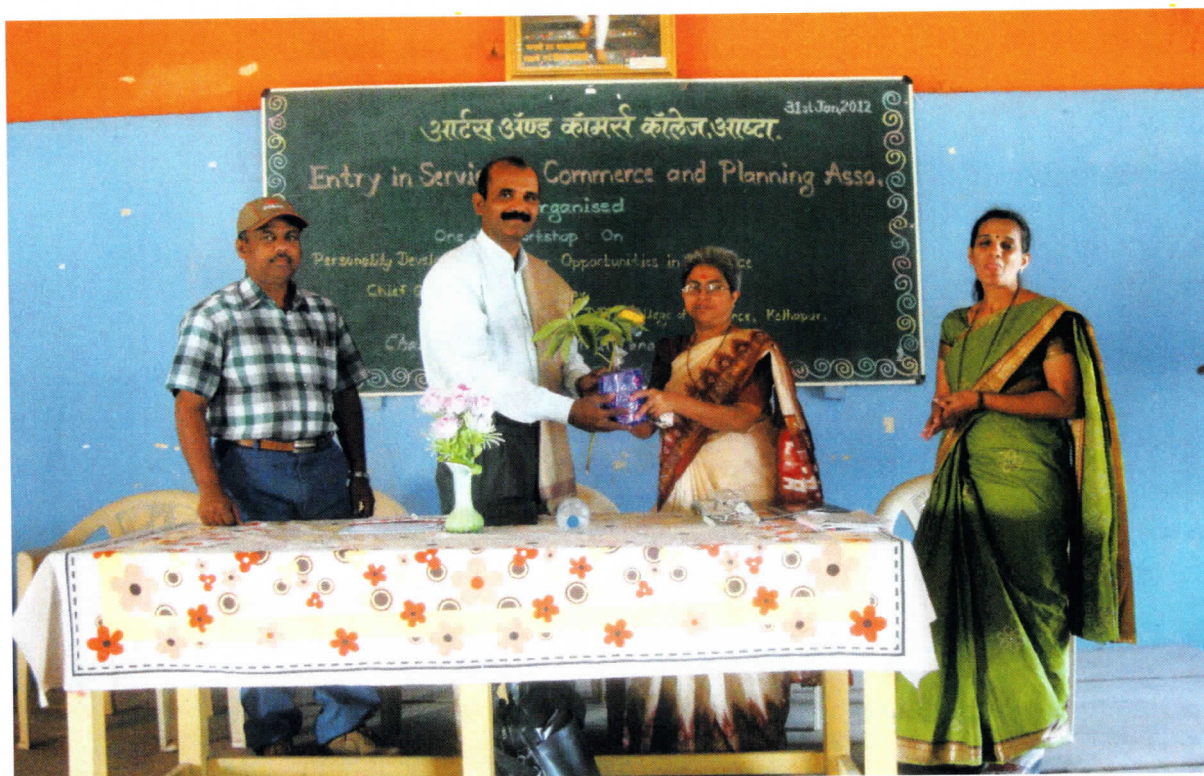
Inauguration of Commerce and Planning Association.