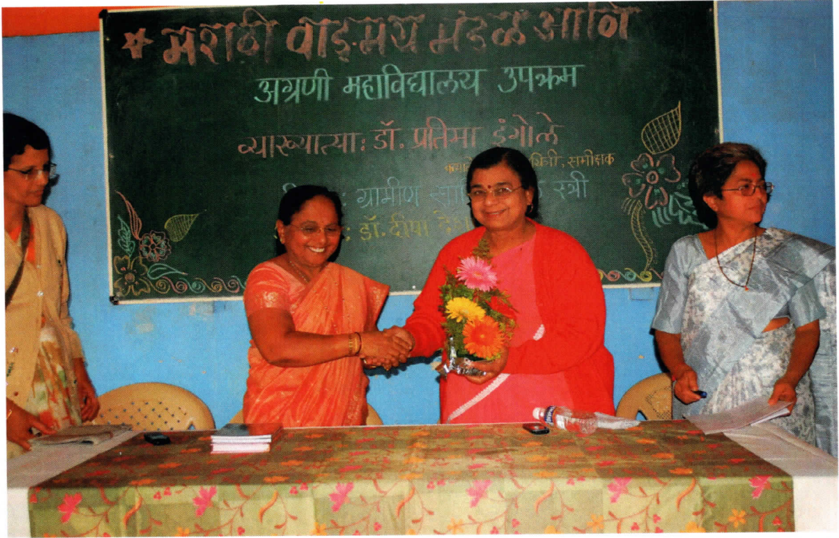
Inauguration of Marathi Literature Association.