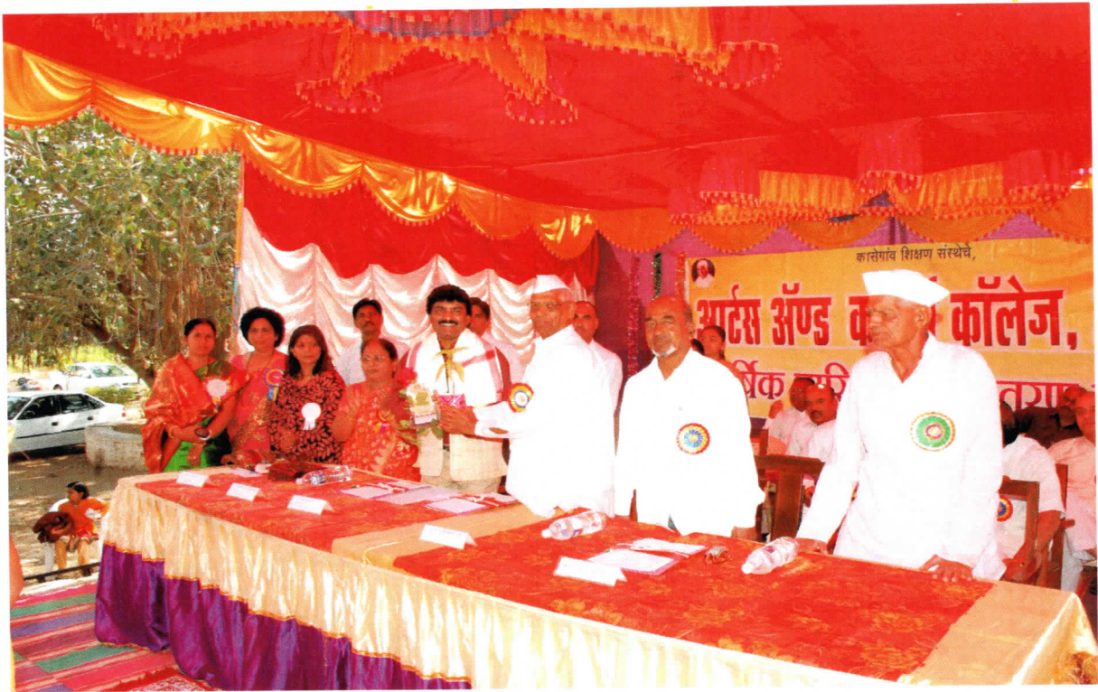
Annual Social Gathering.