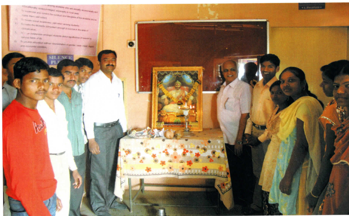
Celebration of Chatrapati Shivaji Maharaj's Birth anniversary by Dept of History.